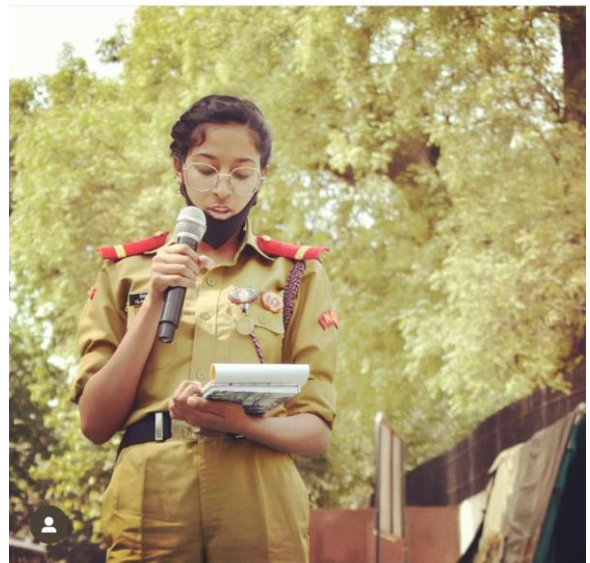
Learning public speaking skills by participating in debate competition