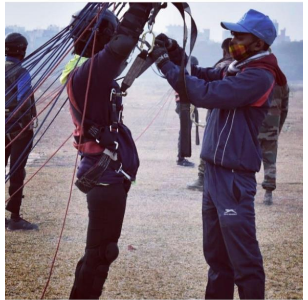
Our cadet undergoing Paraslithering.