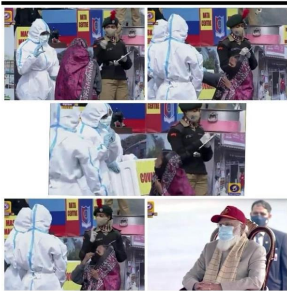
Our cadets performing a skit of Tableaux in front of PM. training for