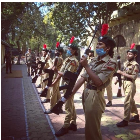
Weapon Training at the camp

The Cadre for them, acted as a blessing in disguise, as they resumed to their on ground activities approximately after 11 months. They left no stones unturned to raise the bar of their College and bagged the IInd Prize in the Singing Competition, and participating in Extempore Competition as well. With elated and joyous experience they signed off their Camp for B Certificate.