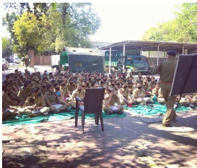
Theory class at the camp