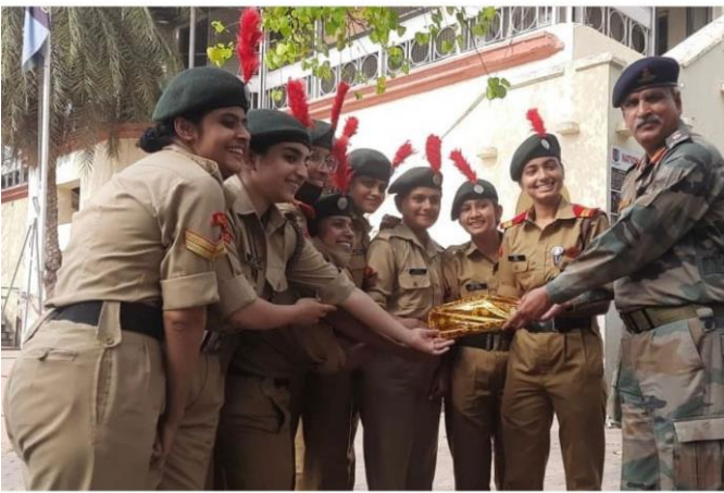
Receiving prize from the commanding officer for standing first in Group Dance competition

Report: the Cadets of Daulat Ram College appearing for C Certificate had completed their ATC Cadre w.e.f 15th March 2021 to 19th March 2021. Third Year Cadets had left no stones unturned. Our Cadets enthusiastically participate in multiple events organised by the Unit and have brought laurels to the NCC Wing of DRC.